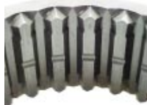
This photo shows the taper of the splines on the shifter slider.

The Atlas was designed to lower your gears and give you a reliable transfer case. The few units that have actually broken shift forks were being used in extreme vehicles, competing in rock crawling competitions. Since time is a factor at these events, the Atlas is being worked hard and shifted hard. The shifting design of the Atlas starts with the shifter slider. This component (shown below) has a taper on the splines (this shifter slider is known as a torque lock slider). When shifted onto a gear that is under power from the drivetrain, this torque lock slider actually pulls the slider onto the gear. When trying to shift the transfer case out of gear in this situation, you're basically opposing the torque of the engine and the taper of the slider with the Atlas shift assembly. The shift fork is then trying to overcome the torque of the engine which is locking the torque lock slider to the Atlas gear. Therefore, to shift the Atlas transfer case under these conditions and to actually get the unit to shift you would have to use extreme force and inevitably break something, the shift fork being the most likely candidate. This locking mechanism on the Atlas also applies when a vehicle front axle is binding, putting torque on the front driveshaft and thus locking the slider on the gear.